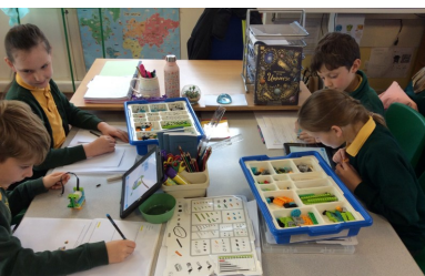
Year 5 enjoying Lego Wedo all about space exploration!