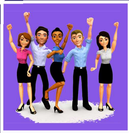
All adults in school