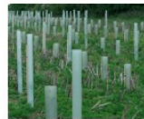
Newly planted trees