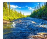
Streams and Rivers