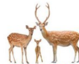
An animal with four legs