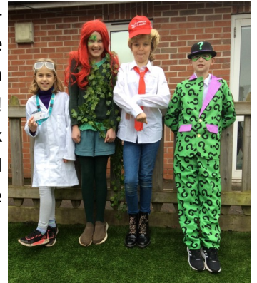
Our favourite costumes of the day

On Friday 17th December we celebrated the end of our topic with a Heroes and Villains Day! We wrote comic book adventure stories and created art work in the style of Roy Lichtenstein.