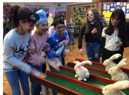
The Christmas Fair